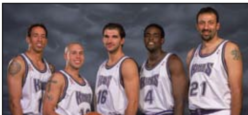
2001-02 STARTERS (L-R): DOUG CHRISTIE, MIKE BIBBY, PEJA STOJAKOVIC, CHRIS WEBBER, VLADIV DIVAC

DID YOU KNOW ... Heading into the 2009-10 season, 389 players have worn a Kings or Royals uniform in at least one regular season game. In the franchise's 60-year history, #20 (25 players) has been the most popular uniform number, followed by #15 (19 players), #21 (16 players), #22 (15 players), and #23 (15 players). The most common names in franchise history are Williams (8 players), Smith (7 players), and Johnson (6).